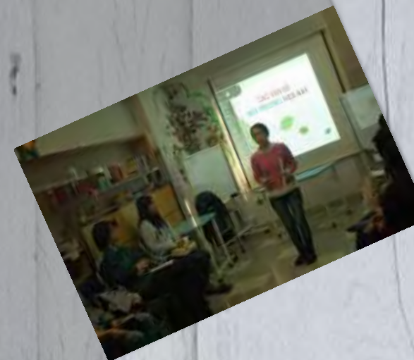
Training for educational administrators and teachers