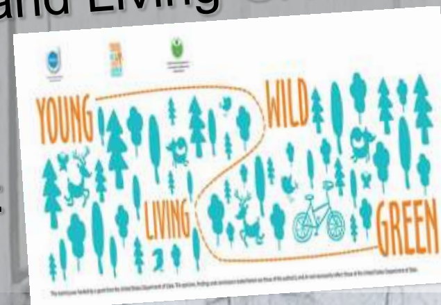
Leader: “Young, Wild and Living Green”