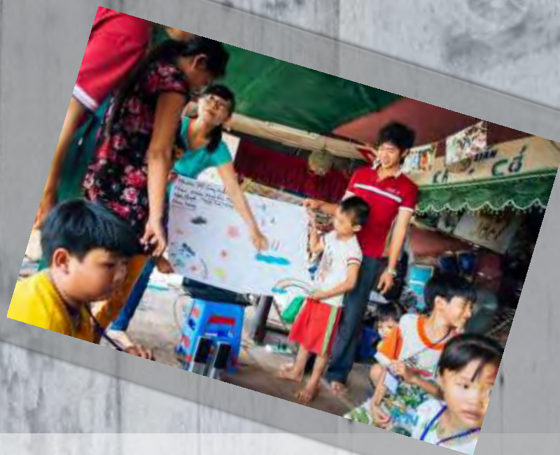
Training for local authorities and parents